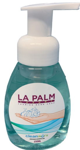
0170014 - 250ML PUMP

LA PALM is a hand wash formulated for luxurious foam delivery. LA PALM has low viscosity and has a pleasing fragrance. Use of LA PALM will leave skin feeling softer, smoother and silky.