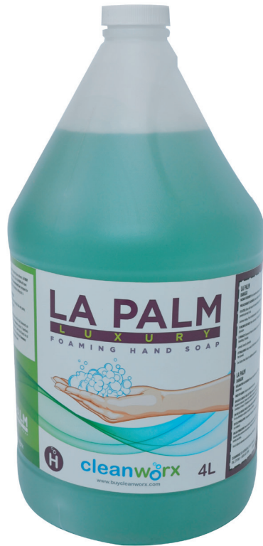
0170017 - 4L